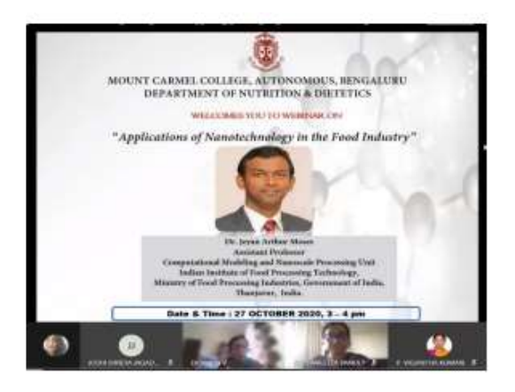
Webinar on application of nanotechnology in food industry