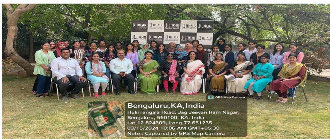
Group picture at IIHMR South Campus, Bangalore